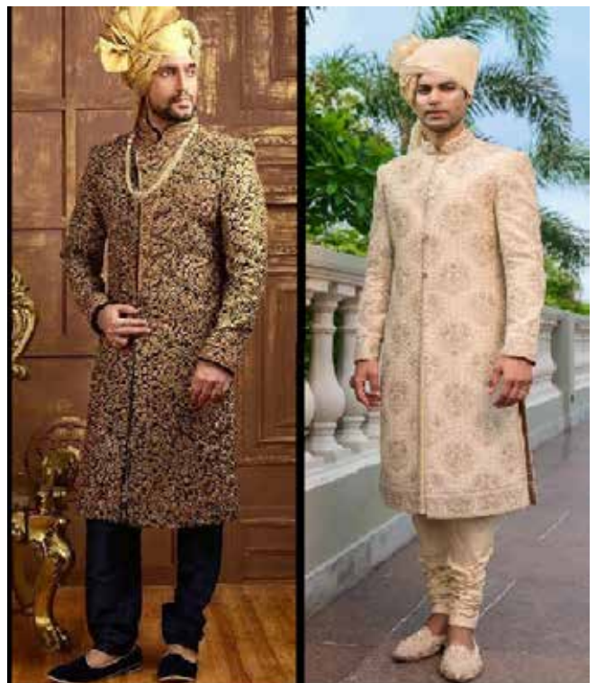
Shirvani clothes. Pakistan, India. Modern works