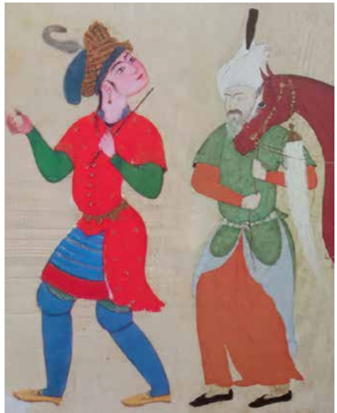
"Chepken" (left) and "chukha" on 16th century Tabriz miniatures

Bayram Khan Baharli's son Mirza Abdurrahim Khan Khanan was one of Akbar's cronies. The military leader and scientist, who spoke native Turkic, Arabic, Persian,