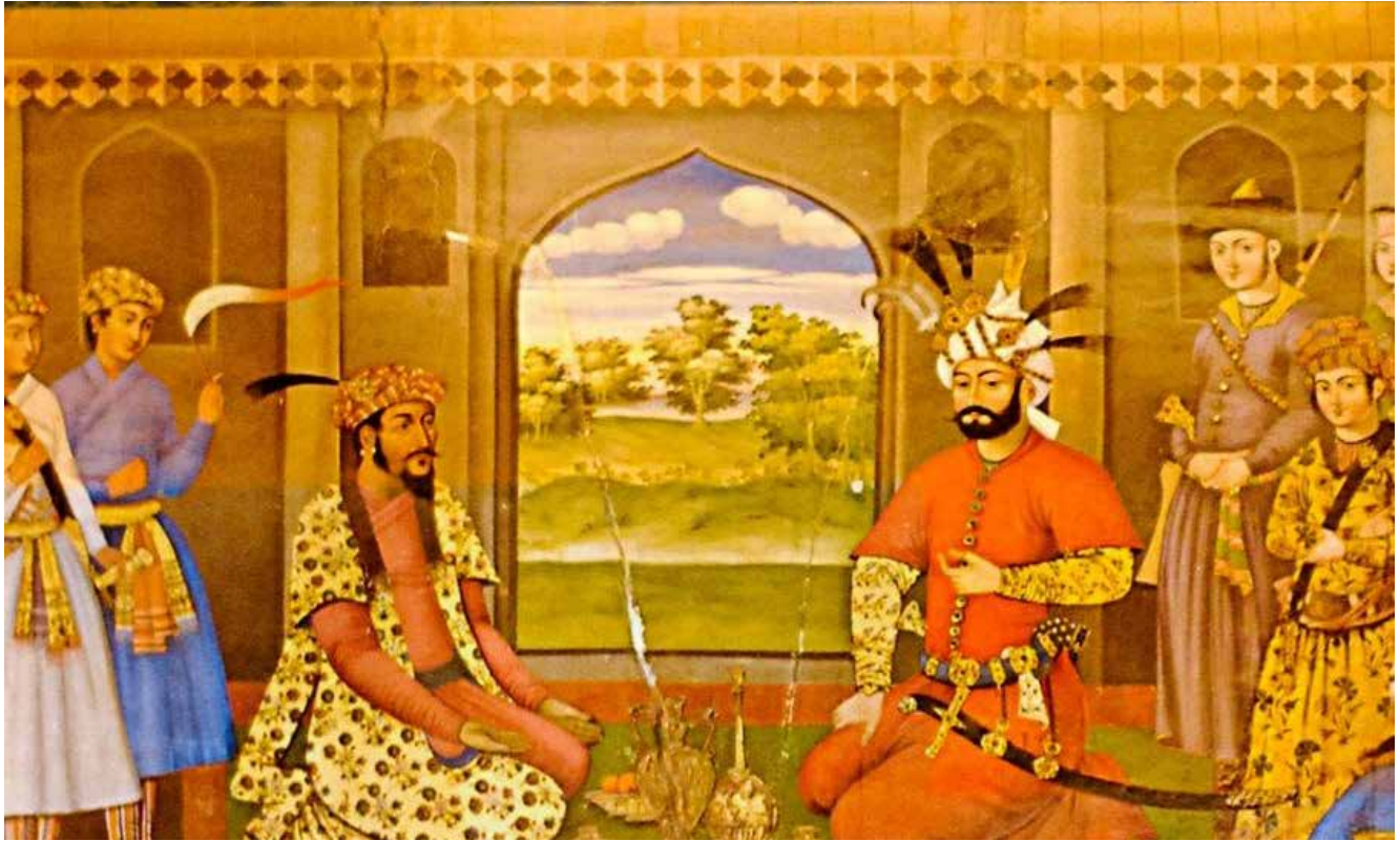
Shah Tahmasib I and Padishah Humayun. Fresco in the Palace of Chikhilsutun. 17th century. Isfahan

detachments and joining Humayun's supporters. The operation ended brilliantly: Humayun was restored to the Mughal throne and the Safavid state received Kandahar, which brought it a huge income.