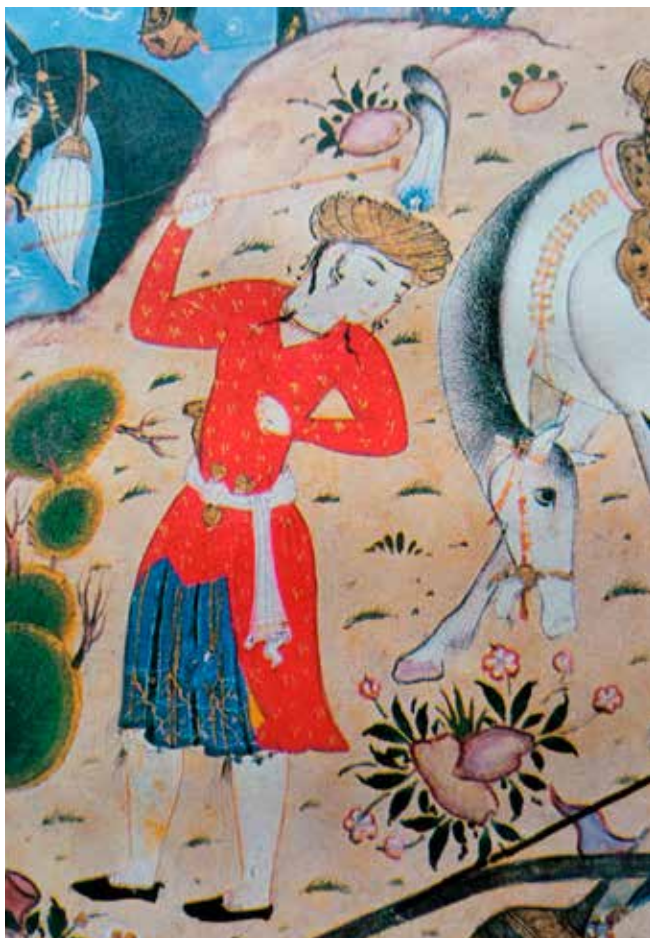
"Chepken" (left) and "chukha" on 16th century Tabriz miniatures