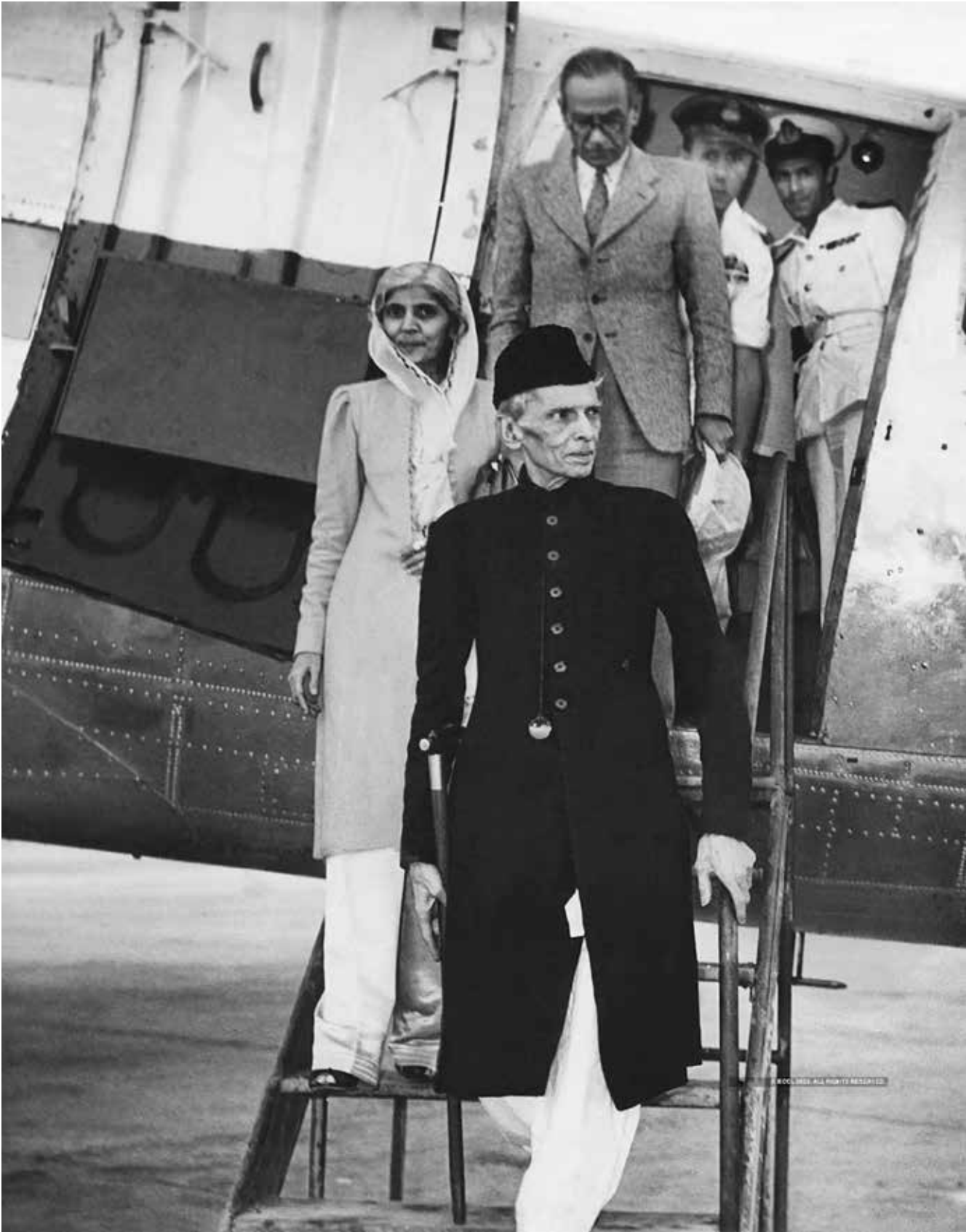
Pakistan's founding father Muhammad Ali Jinnah made "shirvani" a garment for ceremonial occasions.